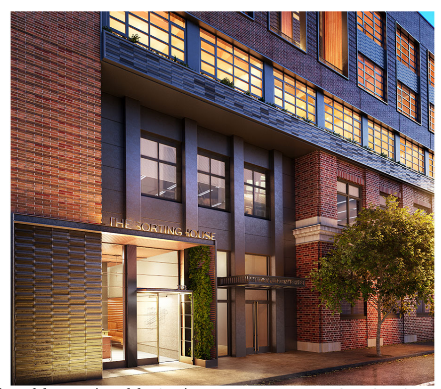
A rendering of the exterior of the Sorting House. RENDERING: WORDSEARCH

Construction of the property is under way. Closings are expected to begin in early 2017, according to a spokesperson for the developer.